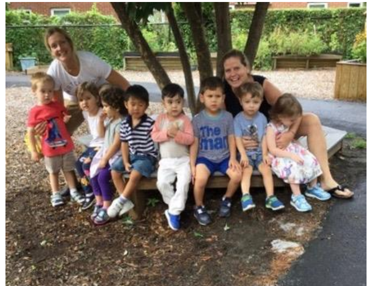
Thurs/Fri AM friends first day of school!